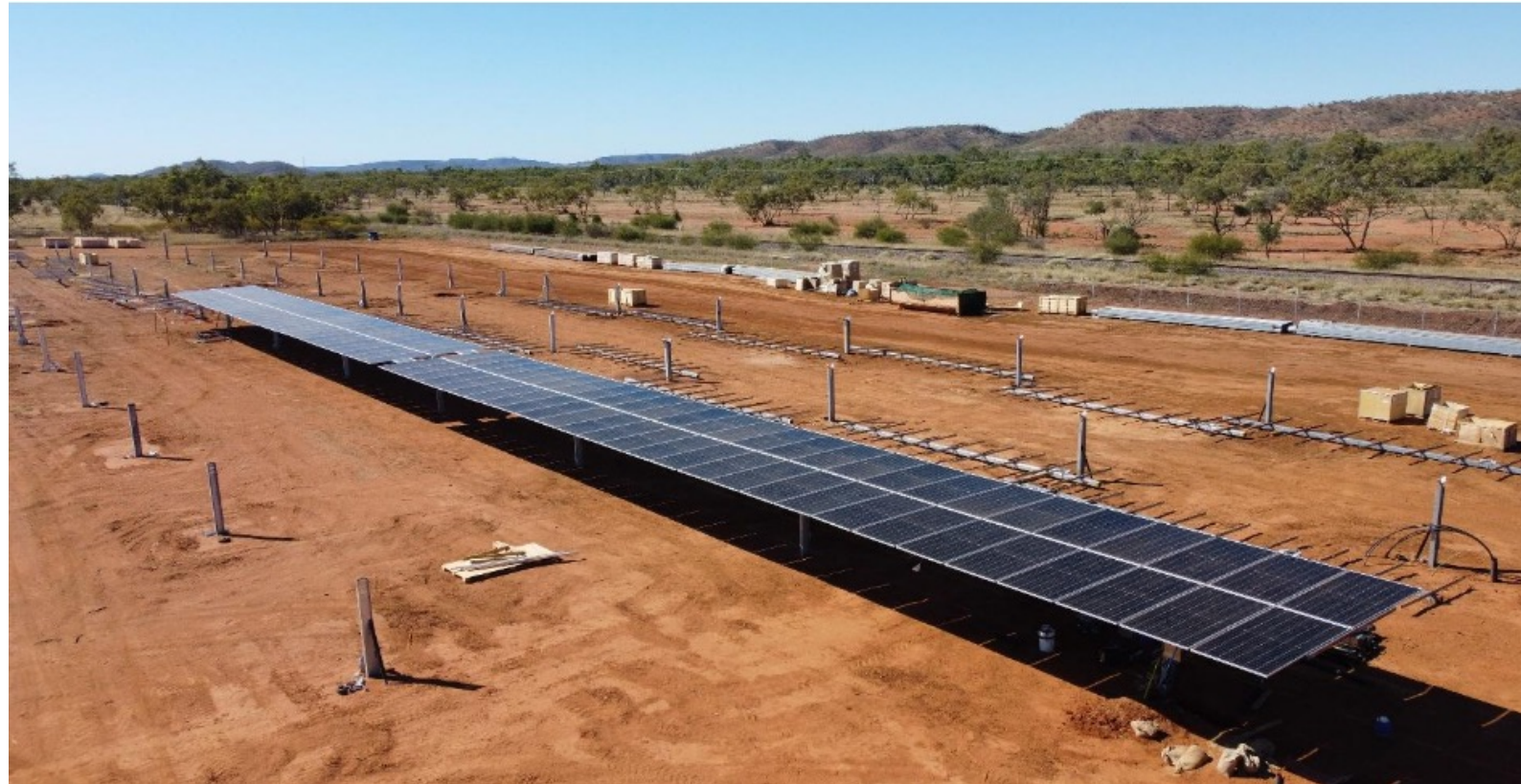
First panel installation, Mica Creek Solar Farm, Qld

Community: Supporting regional employment in construction and operations and reducing local emissions