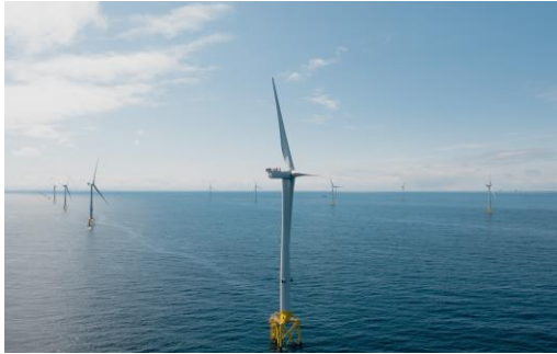
Moray East, 950 MW Operational First R3 Site Consented in UK