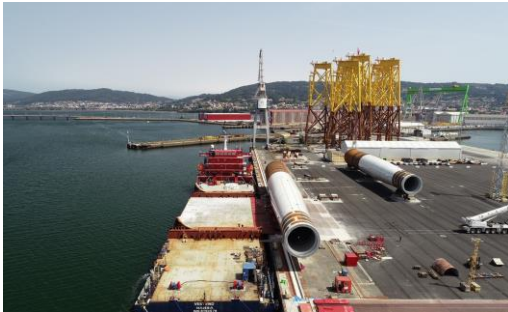
Moray West, 882 MW In Construction