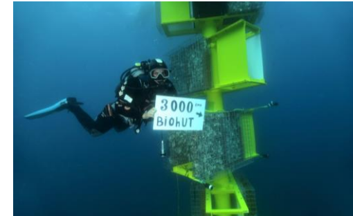
EFGL, 30 MW In Construction Ecological R&D due to proximity to MPA