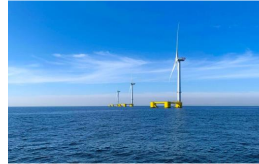
WindFloat 1, 2 MW Decommissioned First Semi-sub Prototype